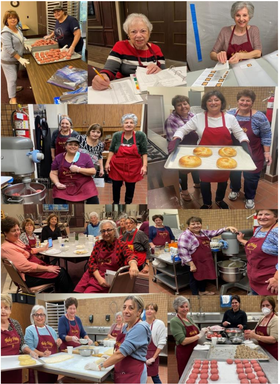
Our hard-working ladies baking, baking, and baking; also, making Kufta for your Holiday baked goods.