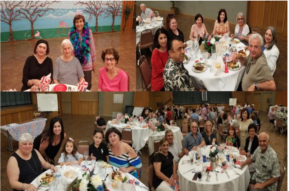
Joint Bingo Event with the Men's Society held on June 2, 2021