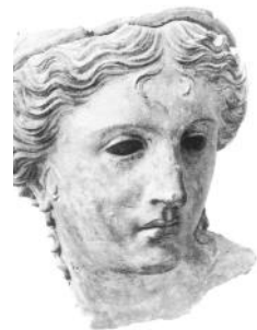
Anahit, Goddess of Nature and Family

These seven gods and goddesses (corresponding in number to the classical Pantheons), plus the Armenian eighth god Vahagn comprise the principal Armenian deities. Of course, there were many lesser deities, as well as spirits, monsters, dragons (vishaps), devils (devils), and other creatures, mostly of the nether world, that make up the collection of mythical creatures in Armenian folklore.